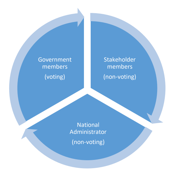
Figure 1: NABERS governance structure

The National Administrator is responsible for the day-to-day operational management of NABERS and does not have voting rights.